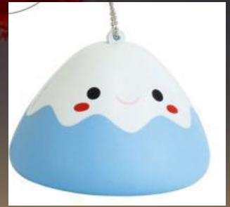
Fuji's Mascot: Fujipon

Hōtō soup. Similar to Udon but the noodles are flat and the dough is prepared like dumplings