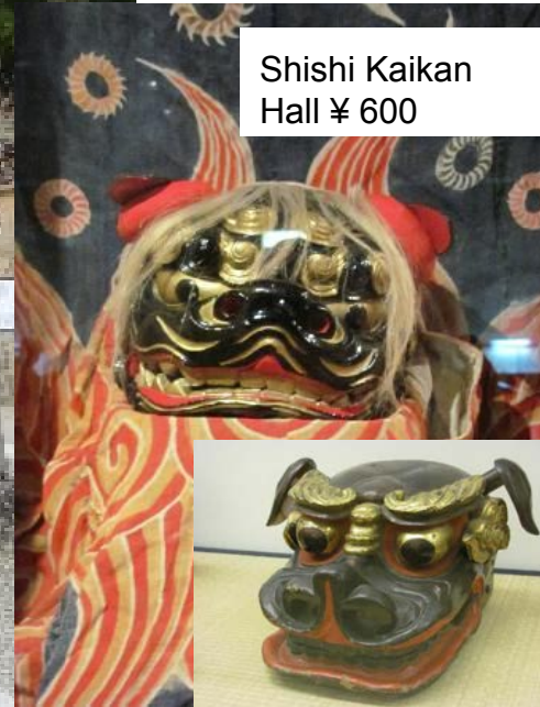
Shishi Kaikan Hall ¥ 600