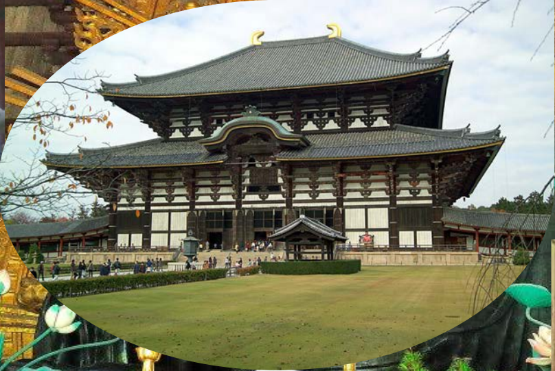
Daibutsuden (Great Buddha Hall)