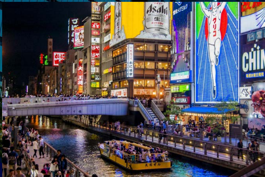
Dotonburi street: Famous shopping and food street