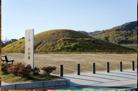
Fujinoki Kofun: Tomb located in Ikaruga, Nara (on the way to Osaka) From the 6th century