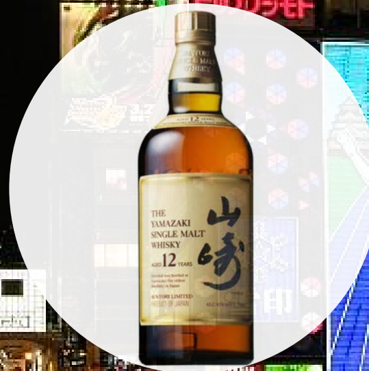
Yamazaki Single Malt Whisky: Famous Japanese Whisky that has a distillery in Osaka. Around 64$(7500 yen)