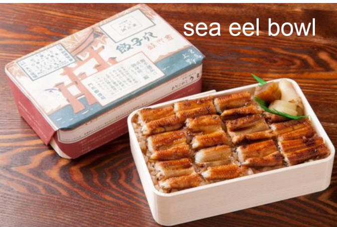
sea eel bowl