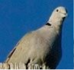
Shirako-bato Eurasian Collard-dove