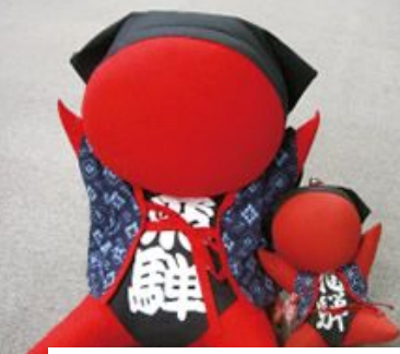
Hida Mascot: ¥ 1,400 Sarubobo doll Saru (prevention/monkey) bobo (baby) female blessings