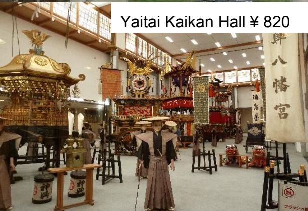
Yaitai Kaikan Hall ¥ 820