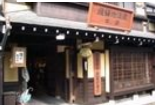
Sake Breweries ¥ 1000 average