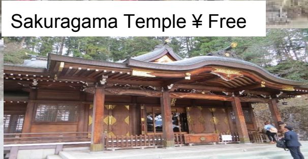
Sakuragama Temple ¥ Free