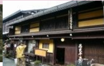
Huda Minzolzu Kokokan Museum ¥ 500