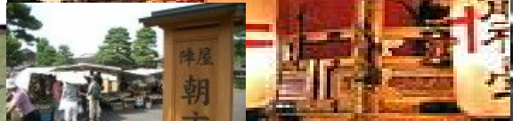
Asaichi Market: Green Tea ¥ 500/100g.