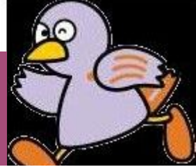
Saitama Prefecture Mascot: Kobaton