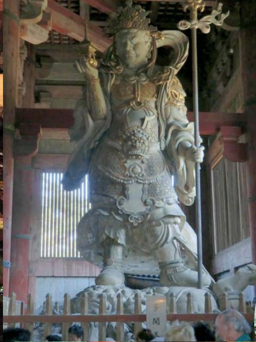
Nandaimon Gate Guardians