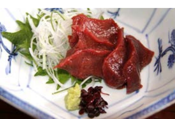
Wild Game: boar, bear, deer ,and horse