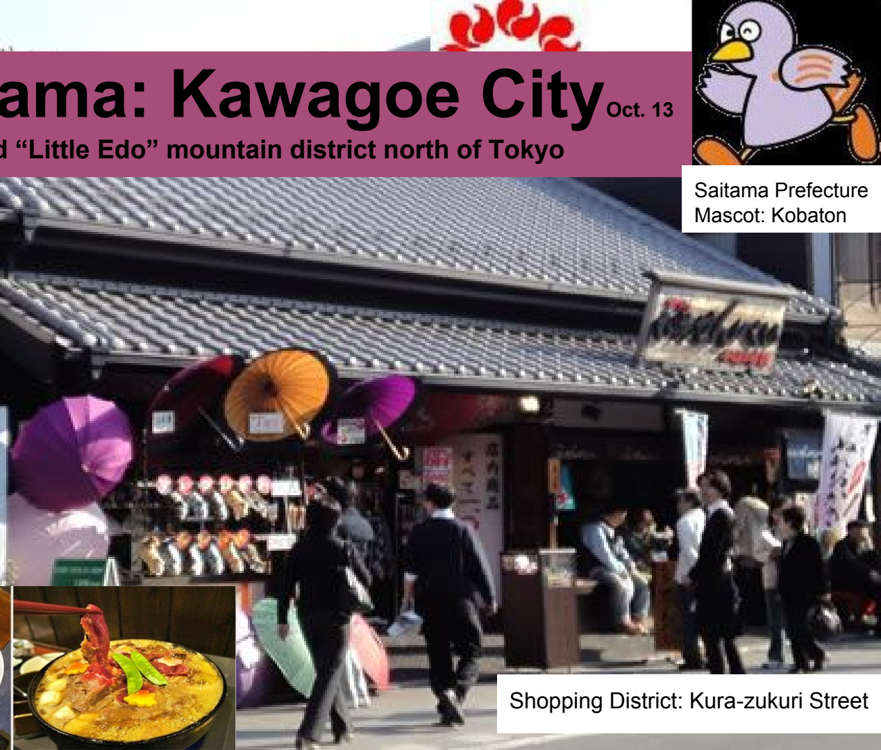
Shopping District: Kura-zukuri Street