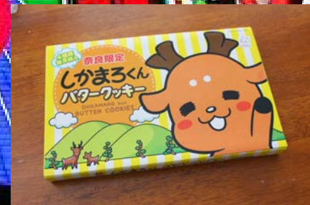
Deer themed cookies