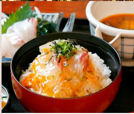
Ikitai Meshi (活き鯛飯)