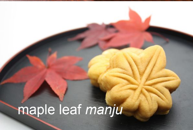
maple leaf manju