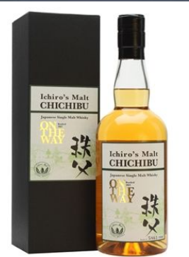
Chichibu Wine is wooden barrel cured malt whiskey ¥ 17, 776 = $148.76